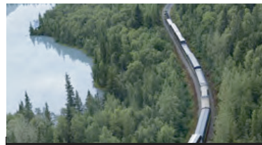
SLOW TRAIN TO ADVENTURE

Part personal tour guide, part concierge and part wildlife expert. All Cruisetours are fully escorted by a friendly and knowledgeable Tour Director.