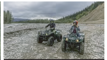
CHOOSE YOUR MEMORIES

Travel in luxury through Alaska's majestic landscape on the Wilderness Express® train, featuring glass-domed rail cars. Along the way, stay in authentic, locally owned lodges.