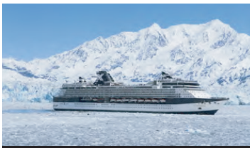
A CAPTIVATING COASTLINE

*Taxes, fees and port expenses of up to $215.40 USD per person are additional and subject to change